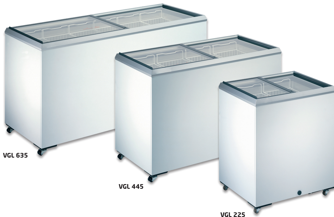
VGL cabinets shown with wire baskets (optional)