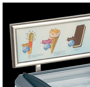
LED illuminated sign