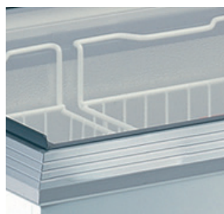
Baskets with dividers ensure efficient organization of products (optional)